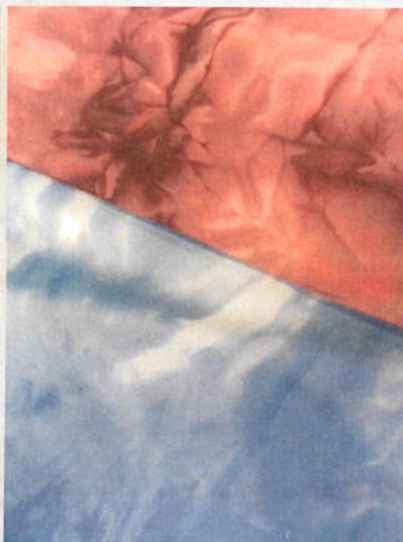
GFusion piece-dyed knit fabrics from Guilford Performance Textiles