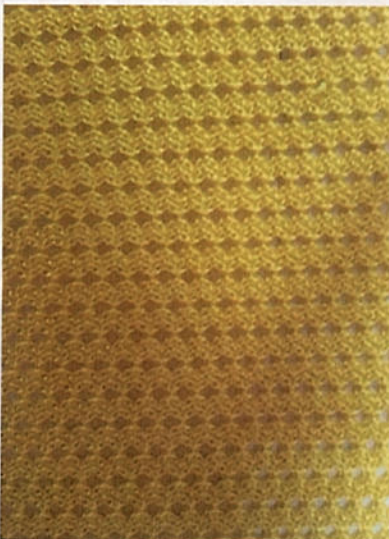
Cordura AFT (air flow technology) fabrics, developed by Tiong Liong